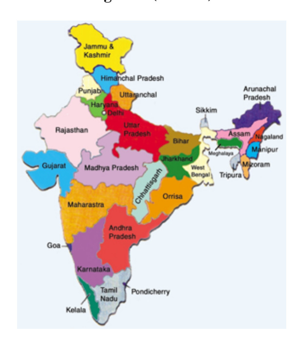
Figure 1 serves as a geographic reference for the states we will be analyzing.

Investment and data on the number of girls passing the high school literacy exam every year was gathered from the Government of India Department of Statistics and the Department of Human Resources. states analyzed because of a female leader were (consult Figure 1): West Bengal, Tamil Nadu, Delhi, Bihar, Rajasthan and Uttar Pradesh. The randomly selected states with a male leader were: Chhattisgarth, Madhya Pradesh, Odisha (or Orissa), Tripura, Sikkim, and Mizoram. For each state, five significant columns of data were collected. A dummy variable was created signifying a female leader; 0 representing a male leader for the given year and 1 representing a female leader. The second column was the number of girls for the year who passed the end of high school literacy exam in the state. An additional column was created that measured the percent change in the number of girls passing the exam year to year. The fourth column was the total state investment in education (in Rupees). The final column measured the percent change in state education investment from year to year. Initially, the goal was to acquire data from 2000 to